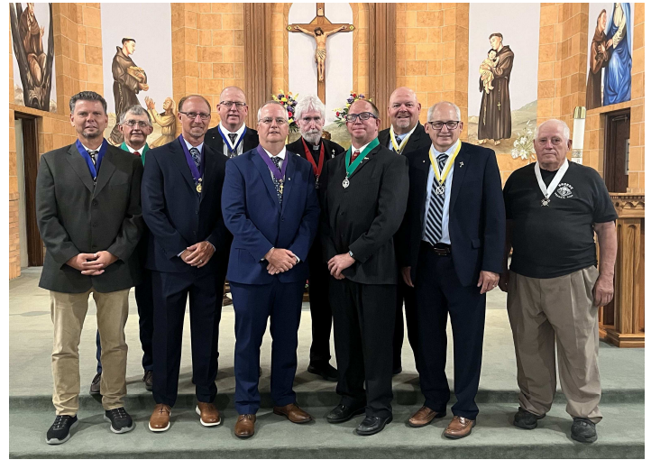
Newly installed officers for the 2024-2025 Fraternal Year after mass at St. Anthony on June 23, 2024.